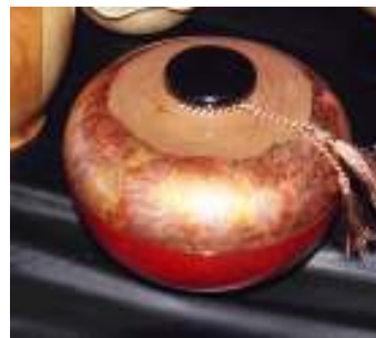
Third Place (tie)