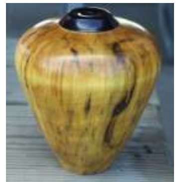
Third Place (tie)