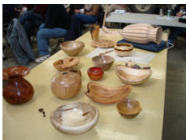
Show & Tell table from the March meeting.