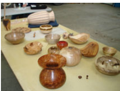
Show & Tell table from the March meeting.

Don't delay sending it in if you are at all interested in attending. This symposium has a set number of guests and when that number is reached, registration stops. This is one of the better symposiums in the country. You won't be disappointed!