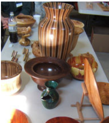
Show & Tell table from the April MAAW meeting.

Reminder: The Michigan Association of Woodturners is a 100% compliant chapter of the AAW. New members and retuning members that have not paid their 2007 national dues are asked to please take care of this promptly so that we may maintain the 100% status of our membership with the AAW national organization. If you have any questions or need help with this, please contact one of the club officers.