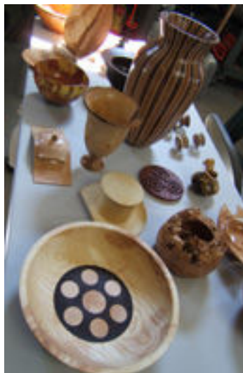
Show & Tell table from the April MAW meeting.