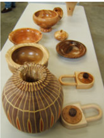
Show & Tell table from the May meeting.

Rare and exotic woods are presently being cut and sealed for turners to pick up from the University of Michigan Museum of Art. Members that signed up for wood will be notified shortly when and where this can be picked up for your turning projects.