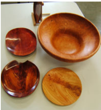
Show & Tell table from the May meeting.