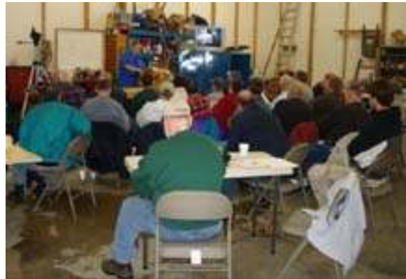
View of a nice turnout for the Burls demonstration at the December meeting.