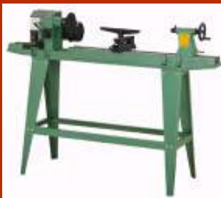
New Club Lathes