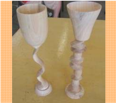
Show & Tell offset turning goblets by Keith Postell