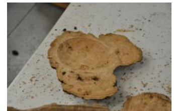
Burl Candy Dish.