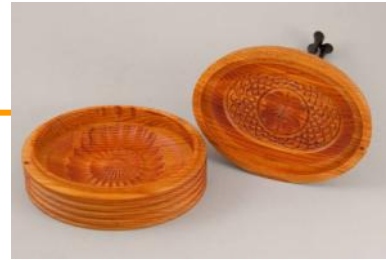
Ornamental turning allows for some fancy embellishments.