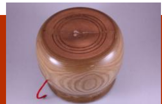
Yarn bowl and jig to route J curve.